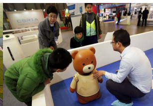
Robots on the move in Shanghai