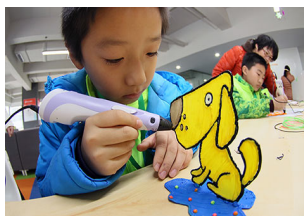
A future in 3D printing