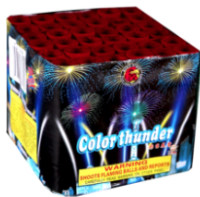
MULTI SHOTS COLOR THUNDER 36 SHO KING BIRD $8.99