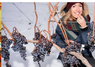
NE China encourages research and development of ice wine industry