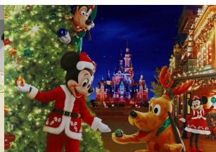
Shanghai Disneyland celebrates its first Christmas season