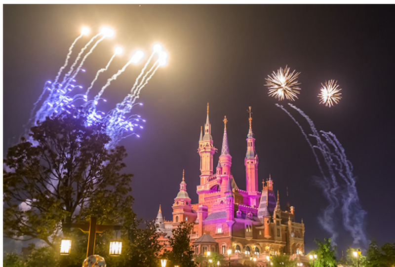
Fireworks light up a castle of the Shanghai Disney Resort.

Chinese producers of fireworks and firecrackers are hoping to make tremendous gains overseas and expand global market share amid growing demand.