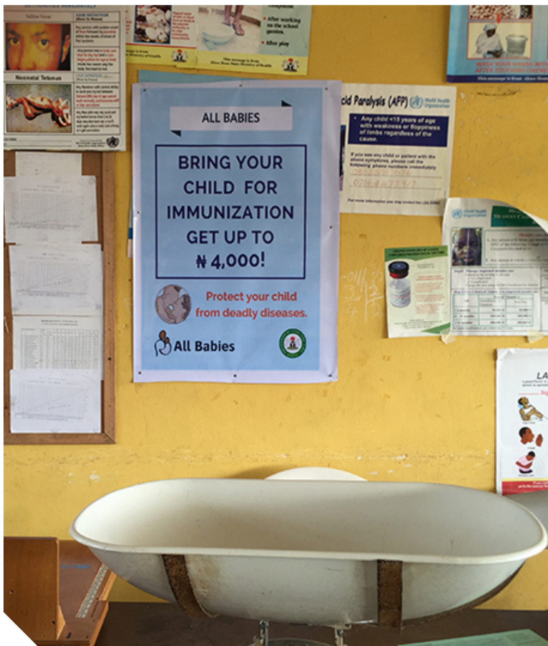
Poster at a clinic promoting awareness of the New Incentives program and the benefits of vaccination.